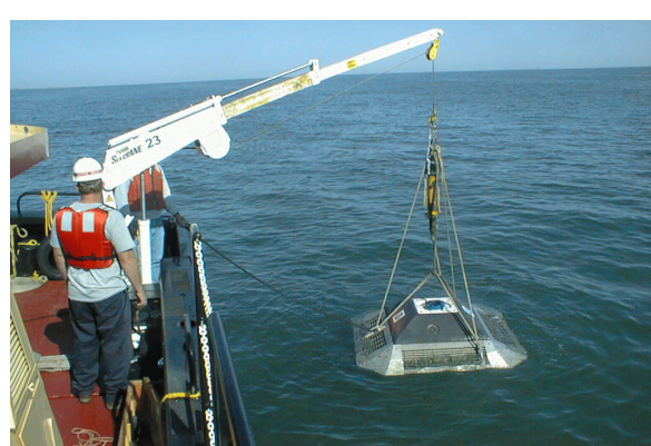
Silver Spring, MD January 2000

U.S. DEPARTMENT OF COMMERCE National Oceanic and Atmospheric Administration National Ocean Service Center for Operational Oceanographic Products and Services